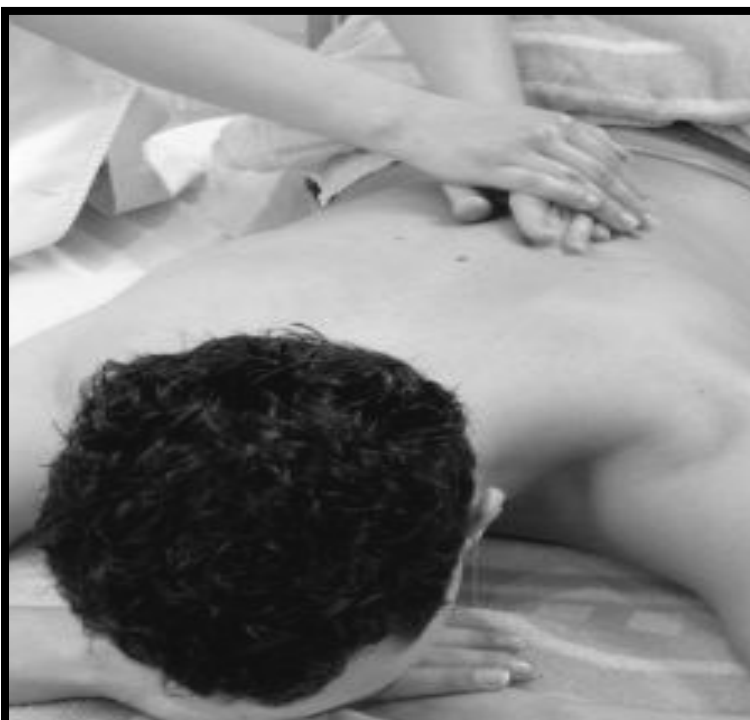
Massage for RSI treatment, see page 9