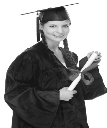
Graduates are twice as likely to have an ergonomic mouse and a better chance of a headset

"It's vital to support all staff members' ergonomic needs ... It's not only the IT department or the Ph.D. researcher who can benefit from a wireless headset... Being able to move around while on a call means a much greater ability to multi-task and less physical discomfort originating from trying to manage a handset, a mouse and a keyboard at the same time."