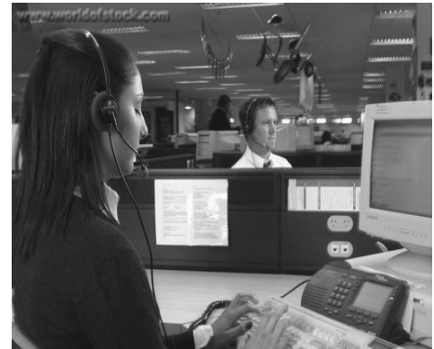
IT workers get the majority of ergonomic office equipment

From this survey, it is clear that companies are more willing to pay for expensive ergonomic tools for their more educated staff. However, this choice may prevent other staff members from staying injury-free and recovering when they do get an injury.