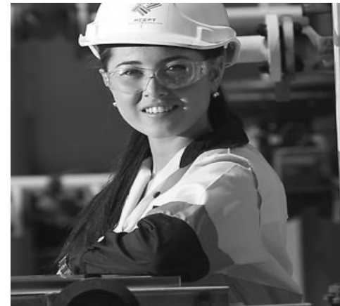
Engineers are more likely to have adjustable tables than other professions