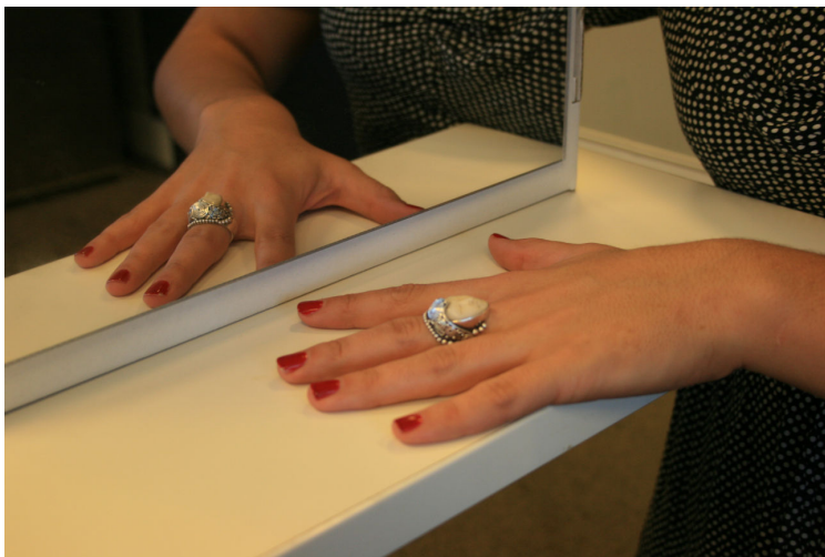
Attendees had fun trying out 'mirror therapy' after the talk.

These interventions will help you to start “rewiring” your nervous system.